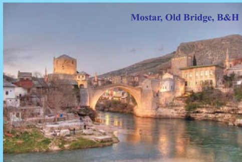
Mostar, Old Bridge, B&H

International standards ISO 9000 - Quality Management System; International standards ISO 14000 - Environmental Management System; International standards ISO 18000 - Occupational Health and Safety Zone; HACCP, ISO 16949, ISO 22000-Food safety management system, ISO 27000-Information security management standards, SA 8000-Social Accountability, Status and trends in development standards; Quality information systems; Quality awards; Standardization; State quality programs; TQM models and their evaluation